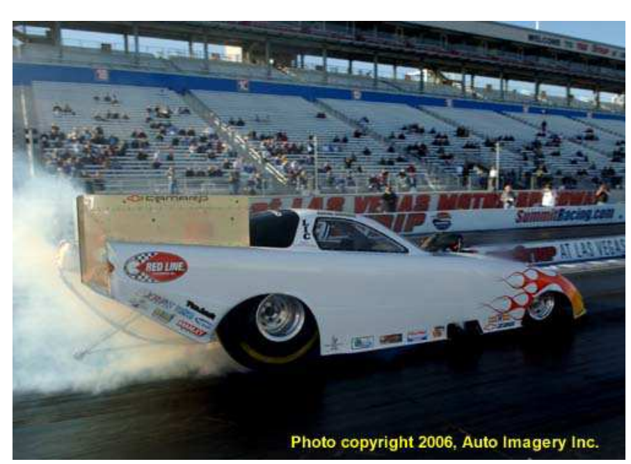
License Pass in Vegas 2006

work and rapidly became the West Coast Hitters in